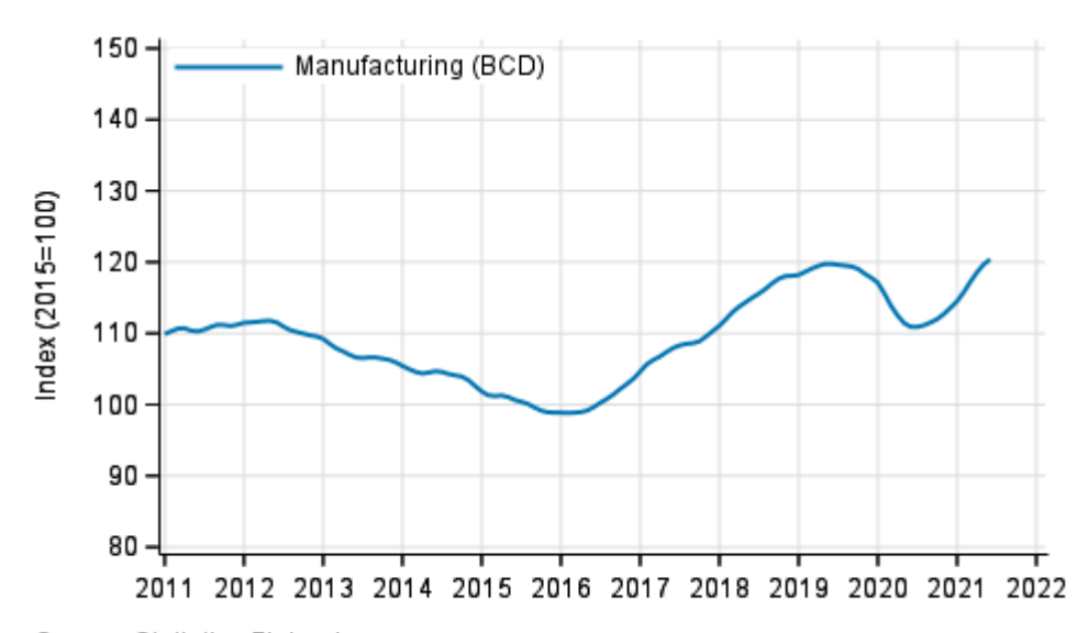
Appendix figure 1. Turnover of manufacturing (BCD), trend series