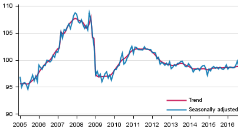
Volume of total output 2005 to 2016, trend and seasonally adjusted series

The series of the Trend Indicator of Output are seasonally adjusted with the Tramo/Seats method. The latest observations of the series adjusted for seasonal and random variation (seasonally adjusted and trend series) become revised with new observations in seasonal adjustment methods. Revisions especially at turning points of economic trends may be significant, which should be taken into consideration when using seasonally adjusted and trend data.