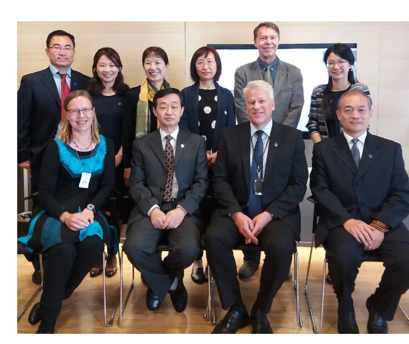
During the study visit on register-based census in the Finnish context, pros and cons of various options of using administrative records in census were discussed.

A joint mission of the National Bureau of Statistics (NBS) China and the UN took place in September 2017 for gaining more understanding of the Finnish experience, methods and challenges of using administrative records for census purposes. The visit was hosted by Statistics Finland's Population and Social Statistics Department.