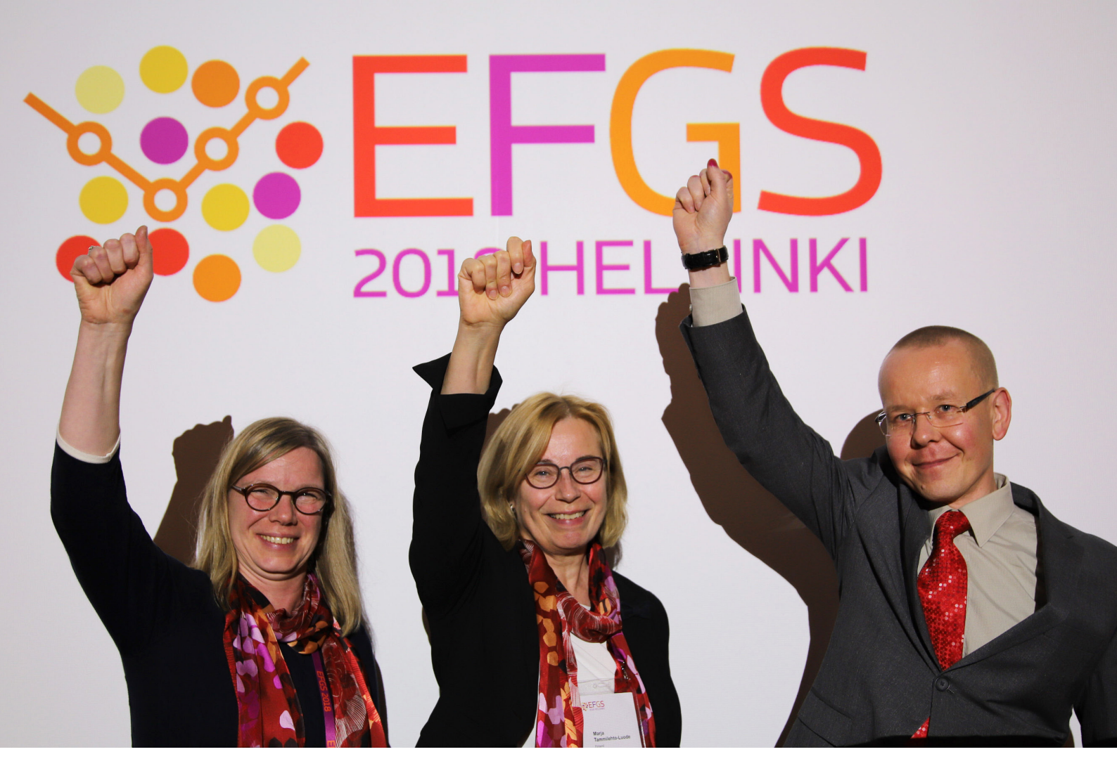
The motto of the 11th EFGS conference was "Finding the Future Together"