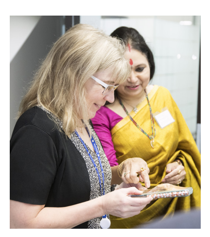
In the study visit of the delegation from India recent developments in environmental accounting were addressed at Statistics

Statistics Finland and the Natural Resources Institute Finland (Luke) jointly hosted the Indian Institute of Forest Management; Bhopal, in a coordinated study visit that took place in Helsinki in June 2018. The overall focus was on environmental accounting and forest statistics.